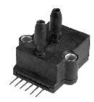
Representative photograph, actual product appearance may vary.

Due to regional agency approval requirements, some products may not be available in your area. Please contact your regional Honeywell office regarding your product of choice.